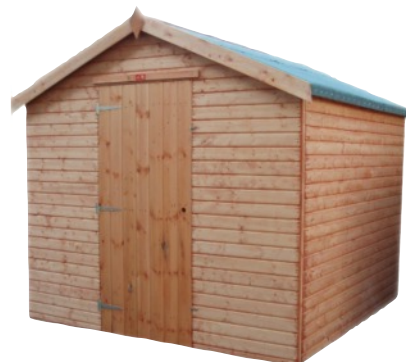
The Euro Range 50x32mm Framing (Nom), Full Euro T&G Cladding 1.7mtr Eaves 2.25mtr Ridge. Lock & Key Included, Windows are Optional