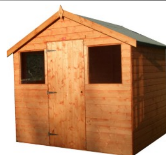
50x32mm Framing (Nom), Full Euro T&G Cladding 1.7mtr Eaves 2.25mtr Ridge, Lock & Key Included, Windows are Optional