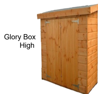
Glory Box High