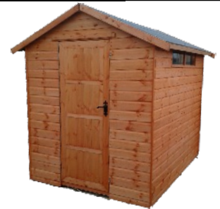
Tanalised What is it ?

Nominal) Sizes are before machining. (Finished) Sizes are after machining.